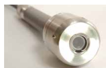
P340 2"/50mm self leveling camera