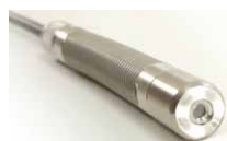
P340 1"/25mm camera

The sonde and locator package is the essential tool to pinpoint pipe location and depth. Locate the sonde with the RD7000DL+ locator. Refer to the P340 flexiprobe brochure for more information.