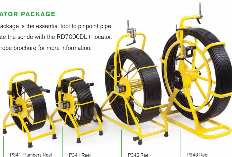
P341 Plumbers Reel