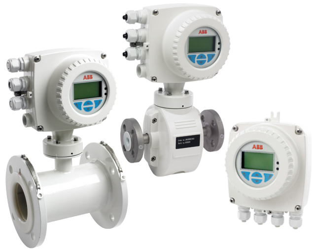
ABB's WaterMaster electromagnetic flowmeter offers the ideal solution for water abstraction applications.

All data collected by the AquaMaster is stored in an integrated data logger, which gathers data on both flow and pressure every 15 minutes. This data can be automatically sent daily via SMS to a receiver of the customer's choice.