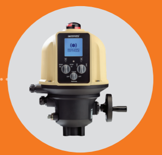
AQ5 - AQ10 - AQ15 - AQ25 - AQ30 - AQ50 - AQ80 - AQ100 AQ150 - AQ280 - AQ430 - AQ610 - AQ830 - AQ1000 LOGIC version