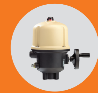
AQ5 - AQ10 - AQ15 - AQ25 - AQ30 - AQ50 - AQ80 - AQ100 AQ150 - AQ280 - AQ430 - AQ610 - AQ830 - AQ1000 SWITCH version