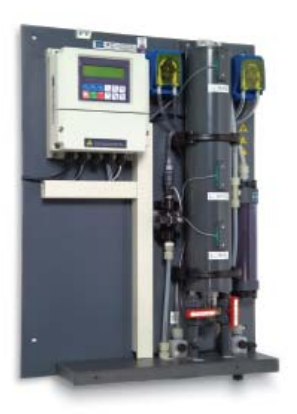
Capital Controls<sup>™</sup> GS4000 Chlorine Dioxide Generator