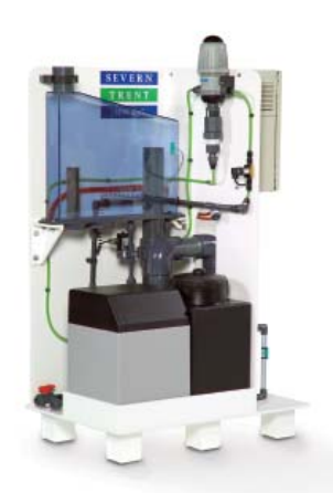
ClorTec® SCT Electrochlorinator

Severn Trent Services has recently introduced a new mini chlorine dioxide generator, the Capital Controls™ GS4000, which is an ideal solution where low dosage rates are required. Generating from 2g/day to 10g/hour, the system is ideal for a range of applications including THM reduction, iron and manganese removal in potable water treatment and Legionella control in cooling water and building services industries.