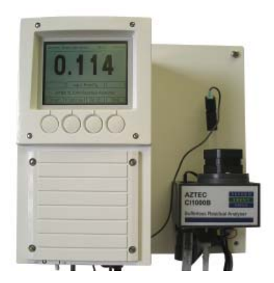
CL1000B Bufferless Chlorine Analyser