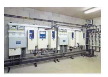
Duty/Standby Chlorine Gas Feeder Systems