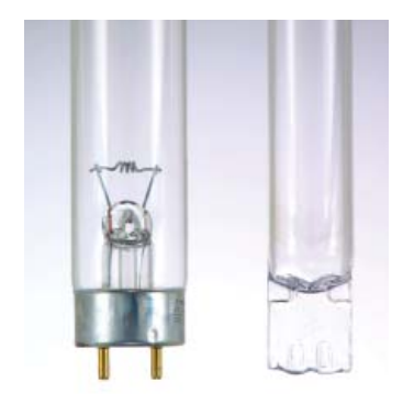
Electroded vs Electrodeless Lamps