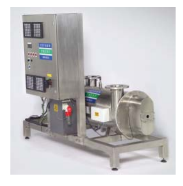
Closed Vessel Drinking Water UV System