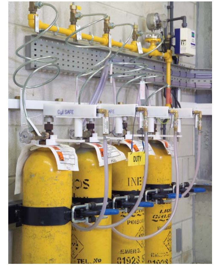
Cyl-SAFE Automatic Shutdown System