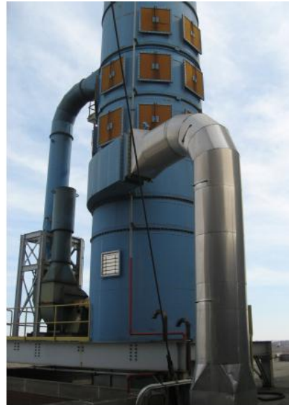
Baghouse operation and maintenance costs are largely a factor of the unit's design.